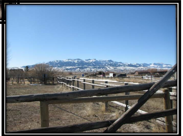
View of Carter Mountain