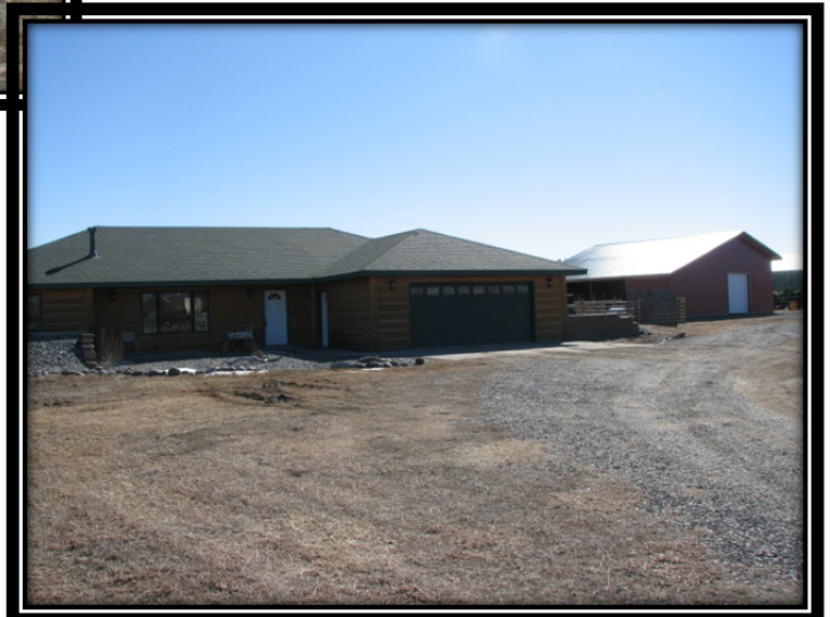
Home & Barn