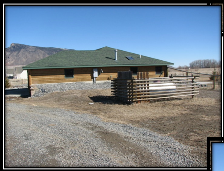
Barn & House